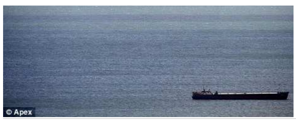
Waiting game: Tankers moored off Devon waiting for oil prices to rise even further

Emma – dubbed SS Santa by the media – brought Christmas presents to Europe in October and is now en route from Algeciras in Spain to Yantian in southern China, carrying containers full of our waste paper, plastic and electronics for recycling.